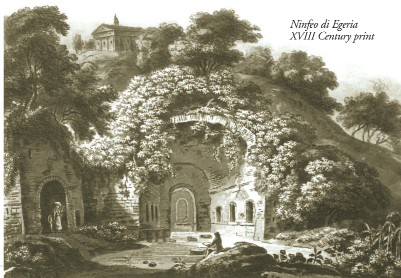
Ninfeo di Egeria XVIII Century print

in the valley was settled a big farm owned by the Caffarelli family (hence the name). After some years, the property passed under the possession of the Pallavicinis