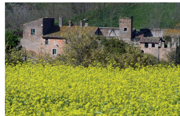
Casale della Vaccareccia

estate started in 1529 with Giovanni Pietro Caffarelli. Later the property of the estate passed to the princes Pallavicini and in 1816 was bought by the duke Giovanni Torlonia. The continuous maintenance and improvement works by the Torlonias, mainly to the complex hydric network, surely helped to preserve the countrylike characteristic scenery that the estate had acquired since the first works by the Caffarellis. Starting from the 1920s an exception to the town planning-scheme provides a division of the valley into streets and lots, and this was confirmed by the 1931 and 1953 plans. The struggle to preserve