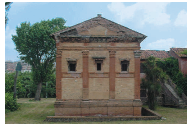
Sepolcro Annia Regilla

The history of human occupation shows no interruptions from pre-modern and archaic age to today.